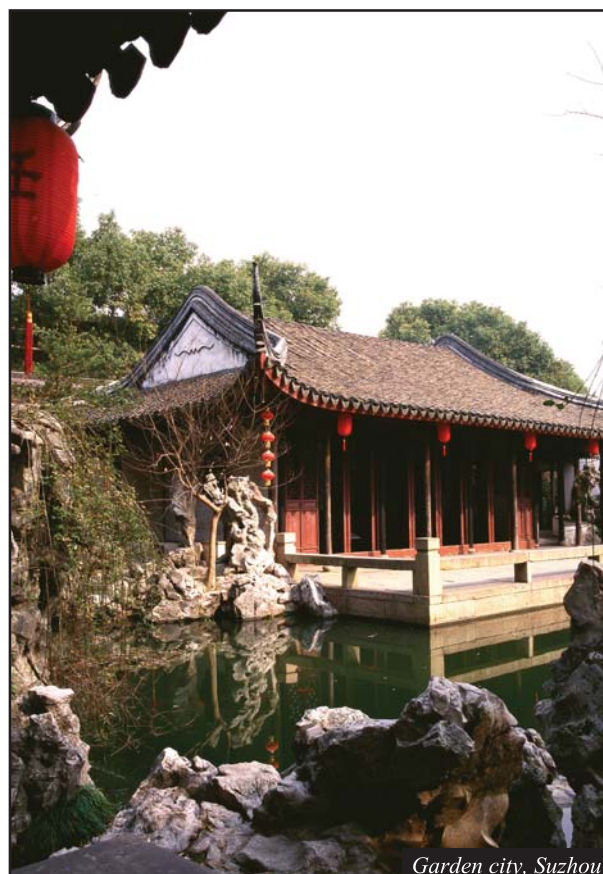
Garden city, Suzhou

* You may choose to stay behind in mainland China, Hong Kong, or stop over in other cities in Asia. Hotel and other services are available with additional charges. Please ask your agent for detail.