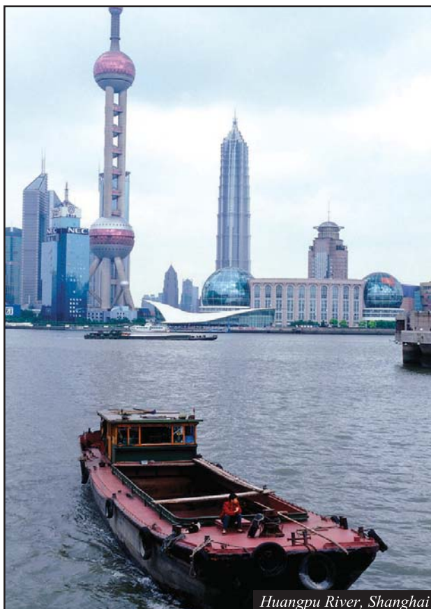
Huangpu River, Shanghai

Shanghai, once a tranquil but busy fishing village, and long