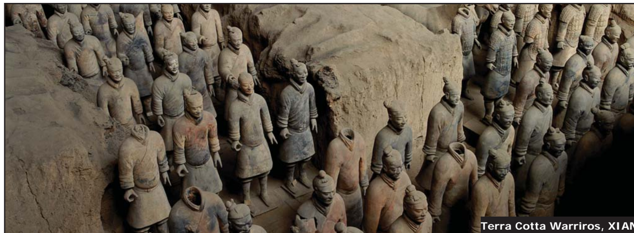
Terra Cotta Warriors, XIAN

*Please refer to "Information and Booking Conditions" for more details.