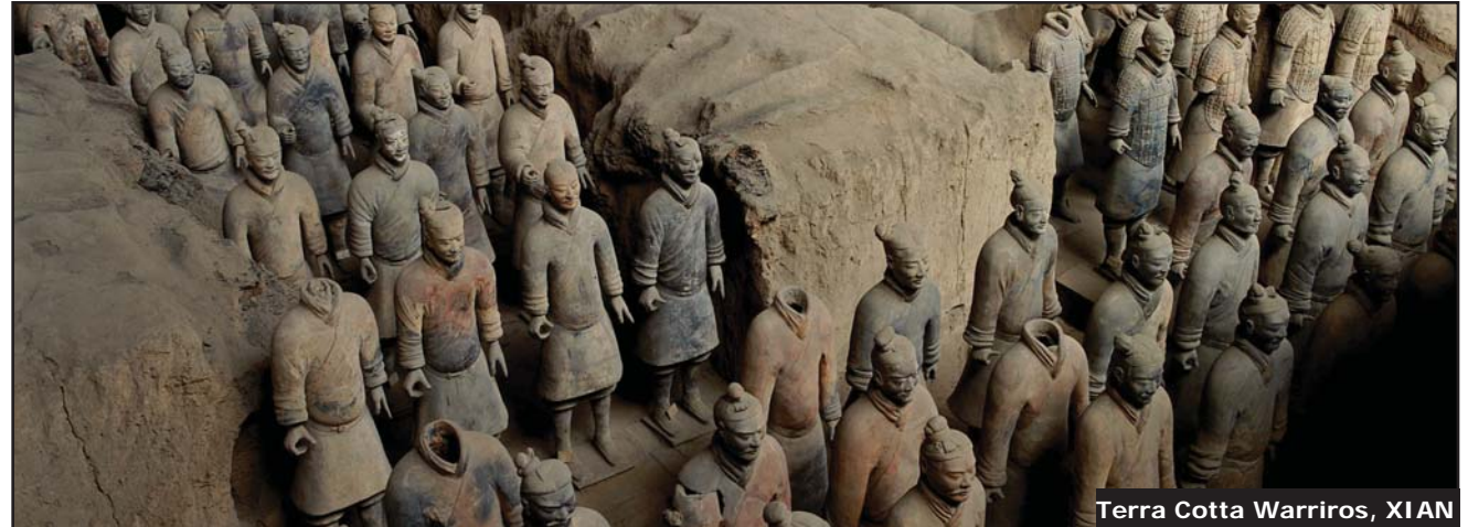
Terra Cotta Warriors, XIAN

*Please refer to "Information and Booking Conditions" for more details.