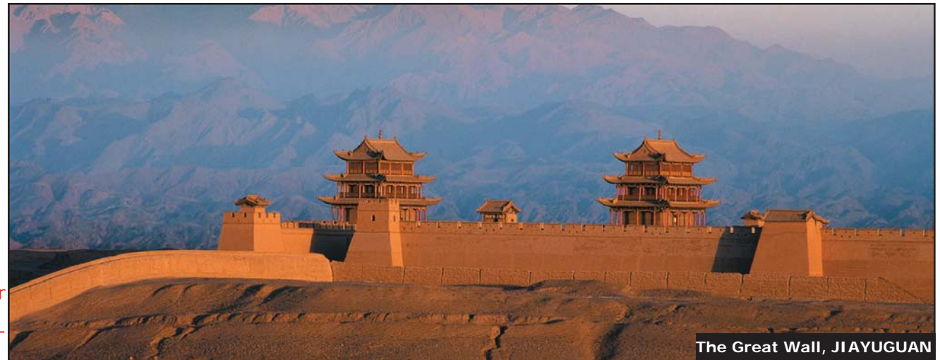
The Great Wall, JIAYUGUAN

Day 6: Urumqi → Dunhuang (Yangguan, Humming Sandy Mountain, Crescent Moon Springs)